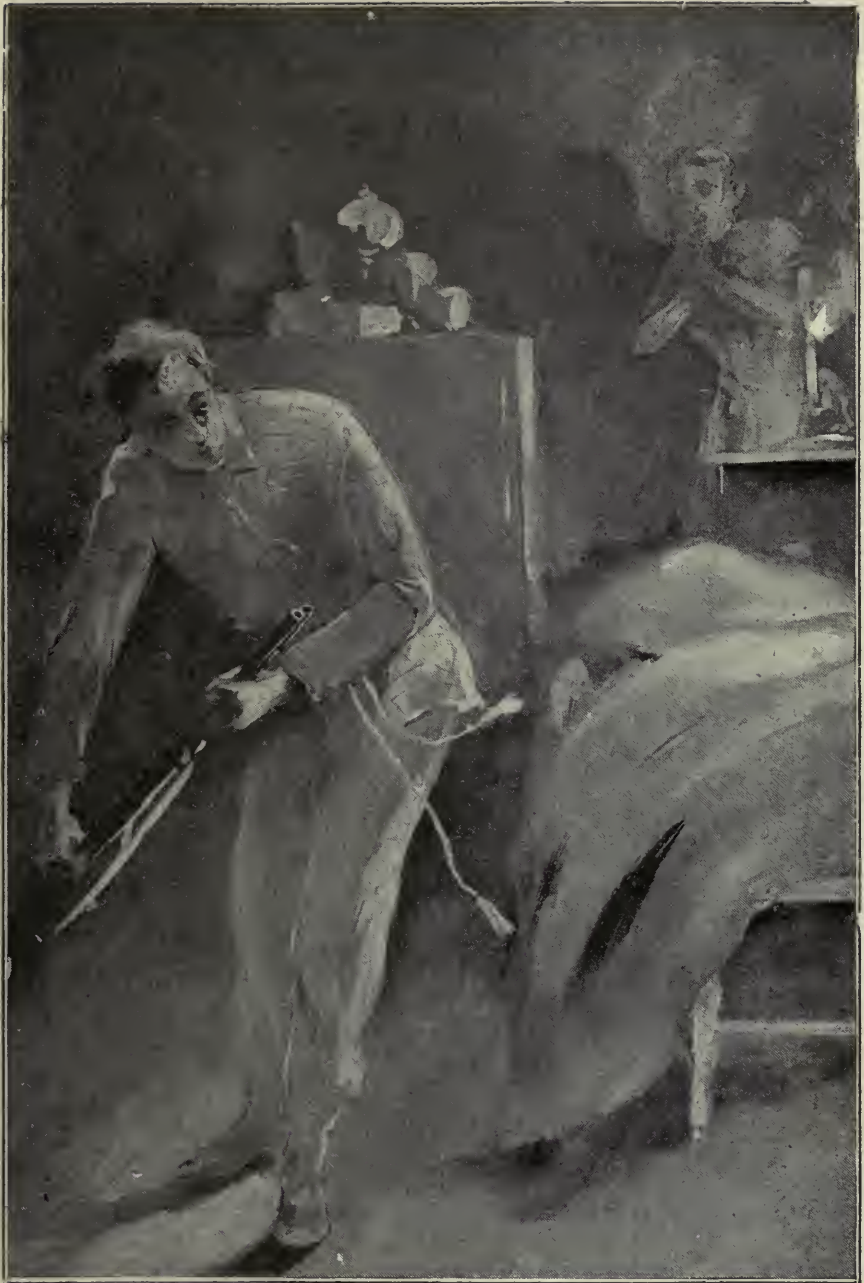
TOOK HIS GUN FROM THE CORNER AND LEFT ME.